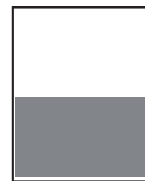
Horizontal 7 1/2" x 4 3/4"