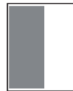
Vertical 3 3/4" x 9 3/4"