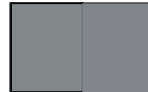
Full Bleed 17 1/4" x 11 1/4" Trim Size 17 x 11